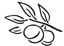
Melanie Tatham Teacher Yr 9 and 10 Integrated Studies

Plums As round as a tennis ball As dark as the night sky As smooth as silk Nice to touch Taste delicious like fruit cake Smell makes my mouth water Summer